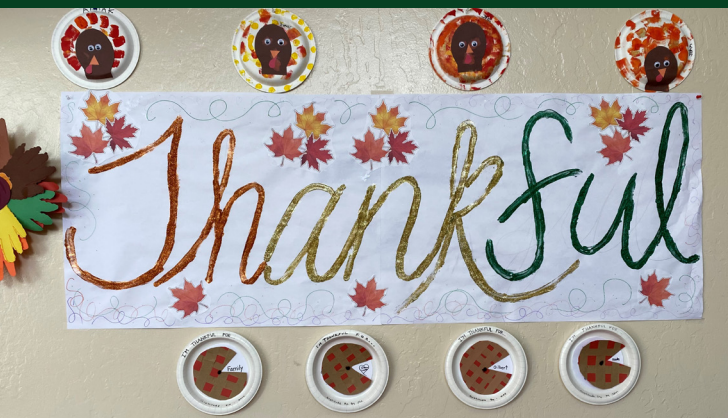
Artwork by Gateway Center Residents

Thank you to our wonderful donors and sponsors! This list reflects donations made from July 1, 2021 — November 11, 2021. If there are any errors or omissions please contact us at info@gatewaycenter.org .